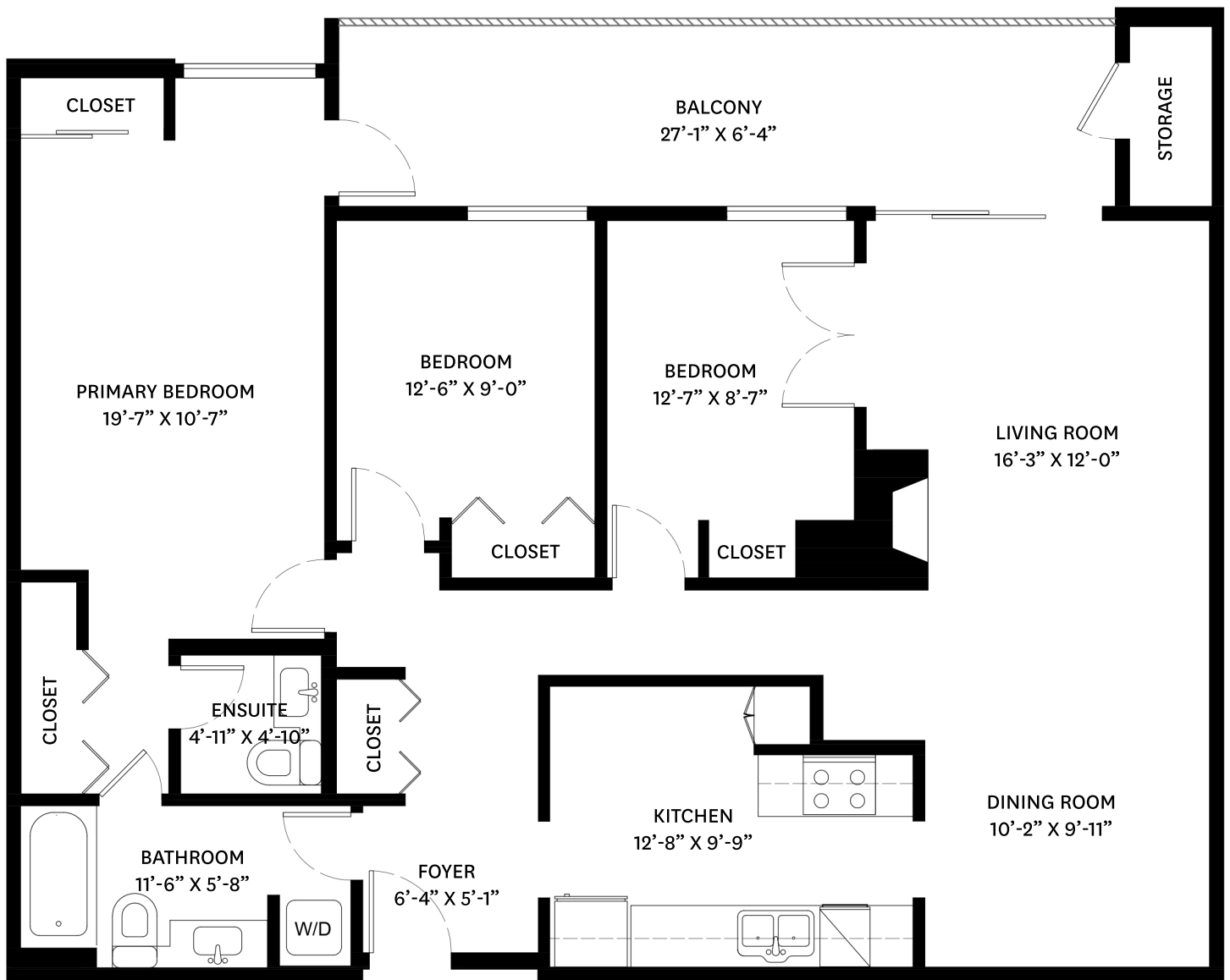
MAIN FLOOR PLAN Ceiling Height: 8'-0"

MAIN FLOOR TOTAL: 1,194 SQ.FT. BALCONY: 171 SQ. FT.